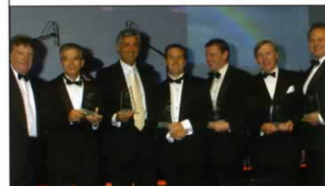
THE SONY FOUNDATION THANKS CORPORATE PARTNERS SINCE 1999